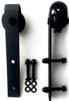
Hanger 2 pcs